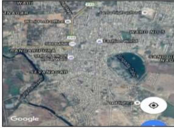
Fig.4. Satellite view of singada talav