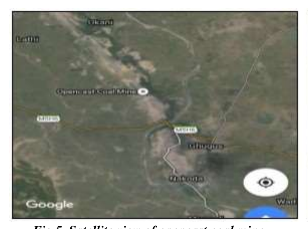
Fig.5. Satellite view of opencast coal mine