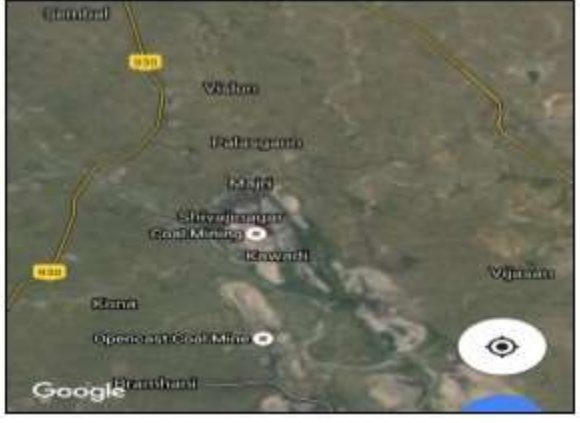
Fig.6. Satellite view of Shivajinagar coal mine

Table 1: Methods Used For Estimation of Various Parameters