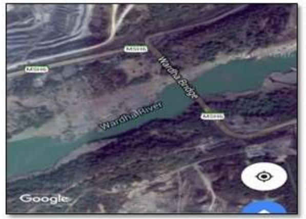
Fig.3. Satellite view of wardha river